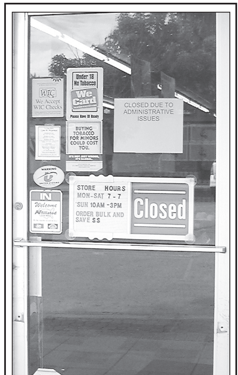
BELLA'S MARKET—State officials were back to collect money for back sales tax owed to Kansas. The store was closed on Wednesday and reopened on Thursday.

Memorials may be made to the St. John Lutheran Church, Bird City.