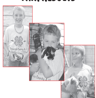
The Saint Francis Herald Bird City Times