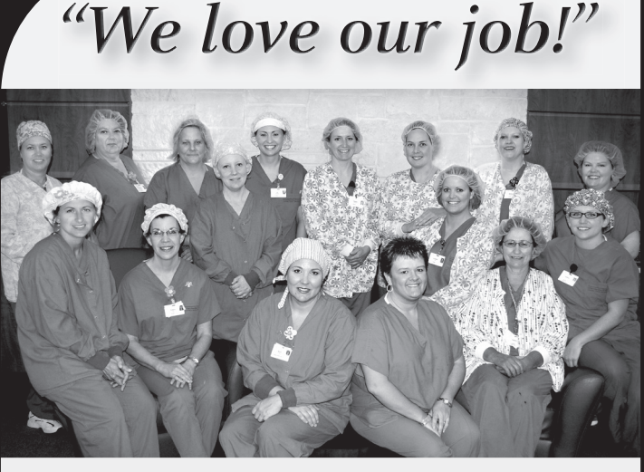
As members of the Community Hospital surgery team, we assist in offering world-class surgical care to our friends and neighbors.

To list your business drop us a card! Call 785-332-3162 today.