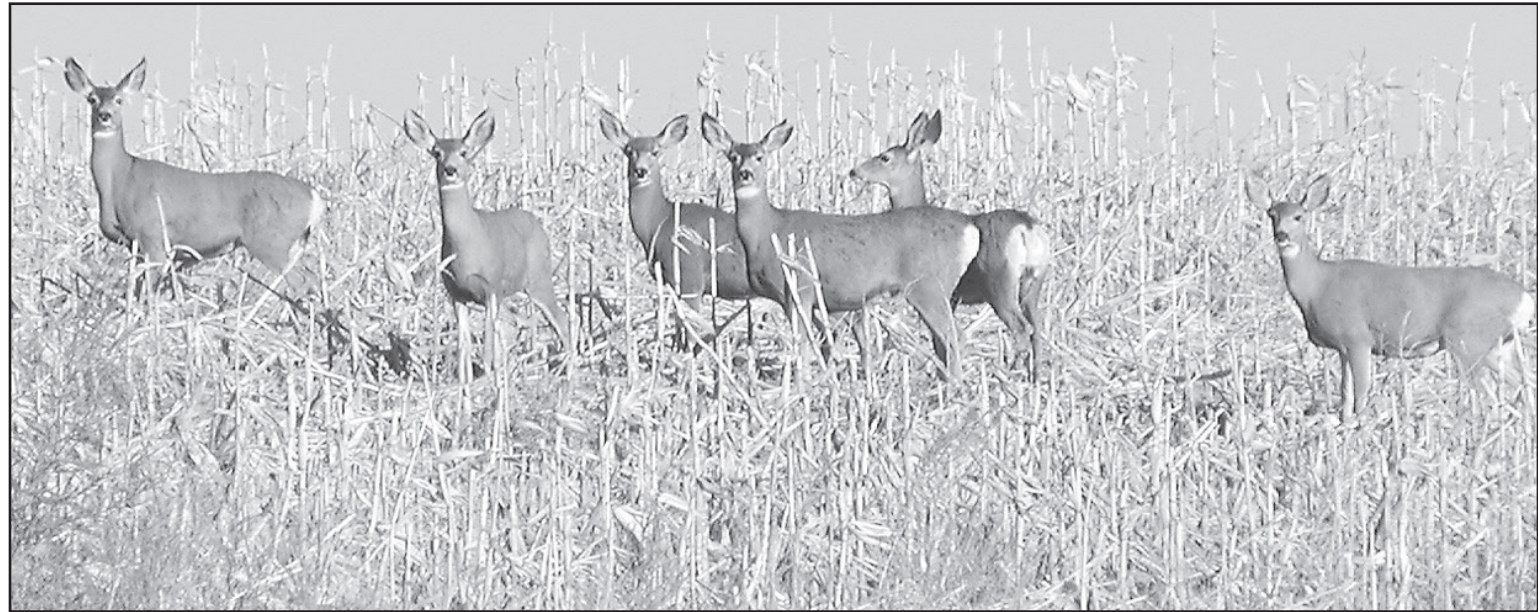
MANY DEER are around and can be a hazard to crops as well as vehicles. Make sure to use caution while driving.

Teaming up with the Craft Show is the St. Francis PTA. Members will be holding their annual book fair in the cafeteria. This is one of the PTA's main money-making projects and the money goes to help the school and students.