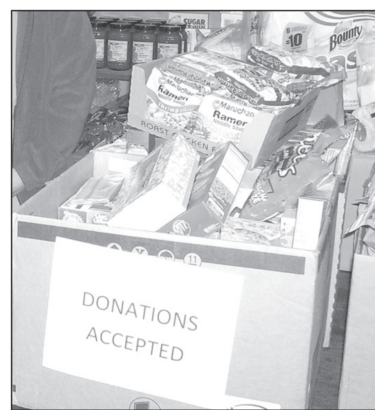
ST. FRANCIS FOOD PANTRY was fortunate to receive boxes of food, personal items and cash donation from PDC Energy of Wray.

Since January, the Pantry has served 25-43 families each month. On average these families equal 140 individuals that receive the food goods through