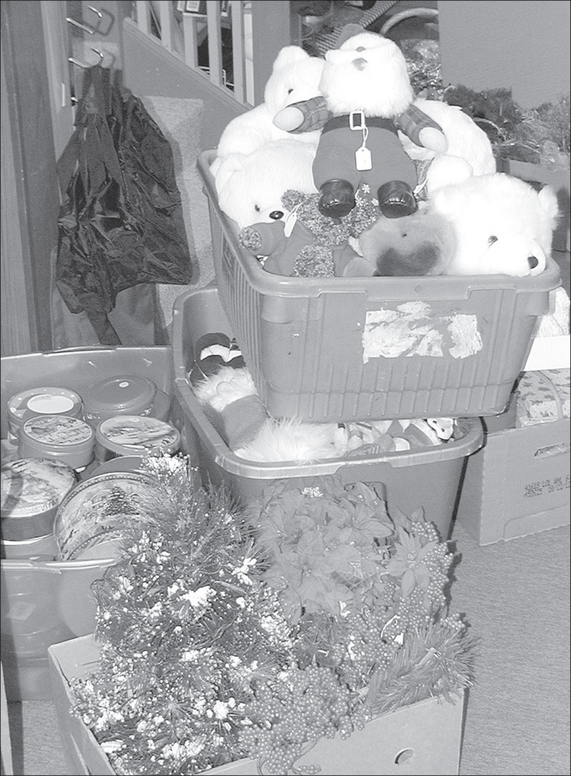
BE SURE TO CHECK OUT the Methodist Thrift Store in St. Francis when the doors open on Thursday morning. Volunteers have worked several days this week getting out all of the Christmas decorations, trees and clothes.