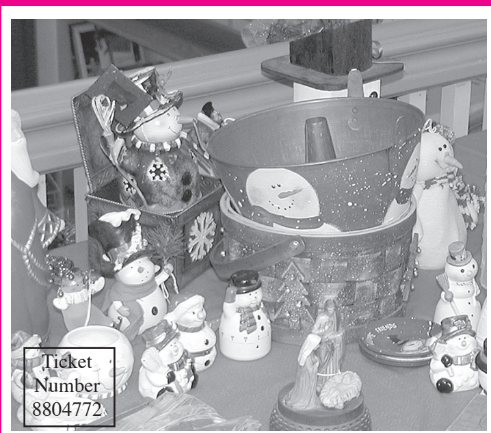
Open Friday night after the Light Parade till 7:30 p.m.

Switch And Receive Switch And Receive The Year! Select Phones ONLY $1 With New Activations!* $200 CASH Bonus With Select Phones When You Bring Us Your Number!* 6-Months Free Add-A-Lines!* Truly Unlimited Data! Ticket Number 592893 Republican Valley Auto Supply Inc. 100 E. Washington St. Francis, KS 67756 Authorized Agent 785-332-2138 877-621-2600 www.nex-techwireless.com alified rate plan and 2-year service agreement. New activations only. While supplies last. $200 cash bonus available with select odels only. Offers expire 12/31/12. Customers are subject to taxes and must meet credit requirements. Certain restrictions apply wave-techwireless.com for complete terms and conditions. Nex-Tech Wireless is eligible to receive support from the Federal I Service Fund in designated areas. As a result, Nex-Tech Wireless must meet reasonable requests for service in these areas. so or complaints concerning service issues may be directed to the Kansas Corporation Commission Office of Plot Affairs and