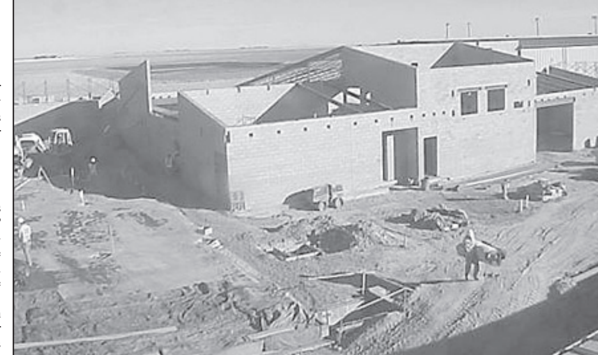
NEW IDALIA SCHOOL is rapidly going up. Workers have had warm temperatures which has helped get the outside up so the roof can go on and the crew can work inside.

We could chat about many things. Some are more important than others. Some things would be great. Others would be horrible. I believe the best thing I could say to them is thanks for making us an awesome nation. Are you proud of America and its Founding Fa-