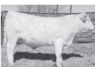
Z053 • Raile X150 X Finks 2250