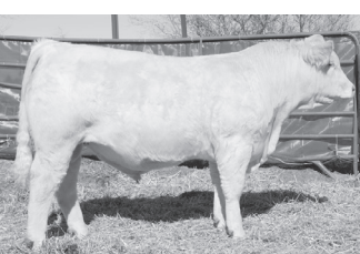
Z050 • Raile X150 X Primecut 0107