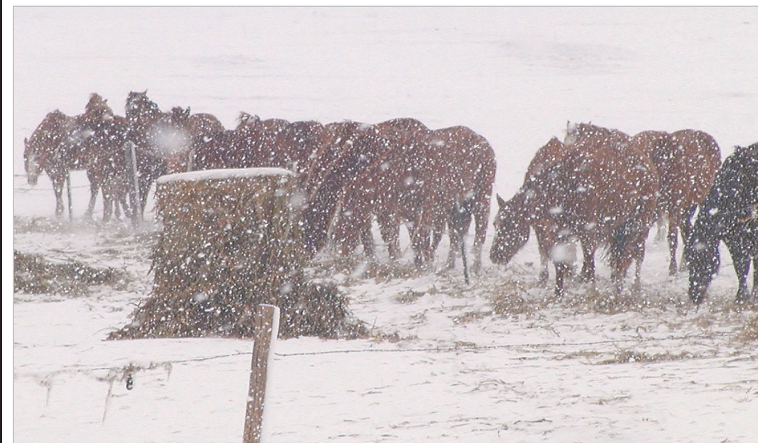
THE SPRING SNOW STORM which hit over the weekend was hard on livestock. Highways were closed and events canceled because of the blizzard conditions. See more about the storm on Page 6.