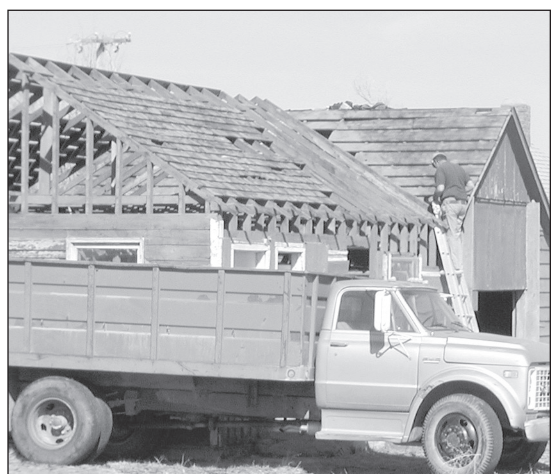
GENE VOELLER tears down the old antique shop located off Highway 36.

We are in need of many people to help with registration, timing, recording the results, handing out the shirts, marking the courses, manning the water stations, directing the participants, and other duties, he said. Those willing to volunteer should call Warren Cico at 772-7098.