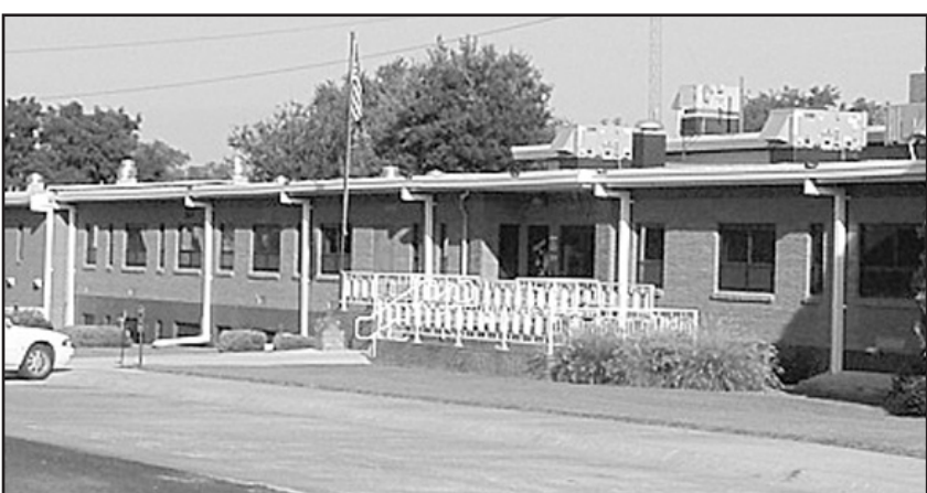
Cheyenne County Hospital

785-332-3172 U.S. Highway 36, St. Francis