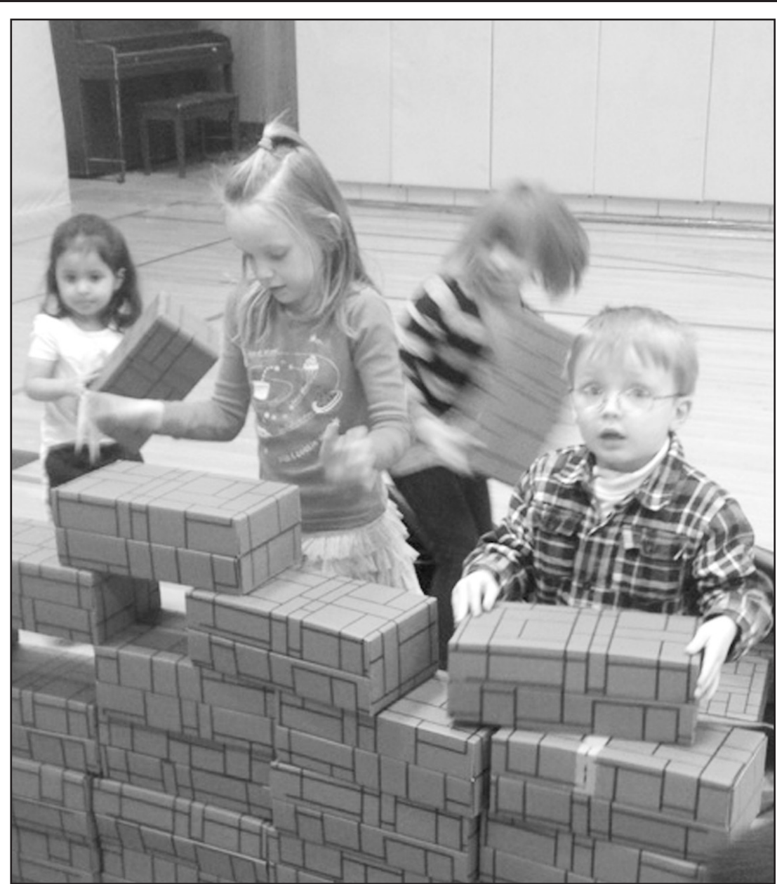
BLOCK PARTY TIME! Headstart students participated in a learning activity in the grade school gymnasium.

If anyone is contacted by a person that you don't know who wants money or is suspicious, let the police department know. The police department's number is 785-332-3330, or the sheriff's department is 785-332-8880. The information may save others from a serious loss of money.