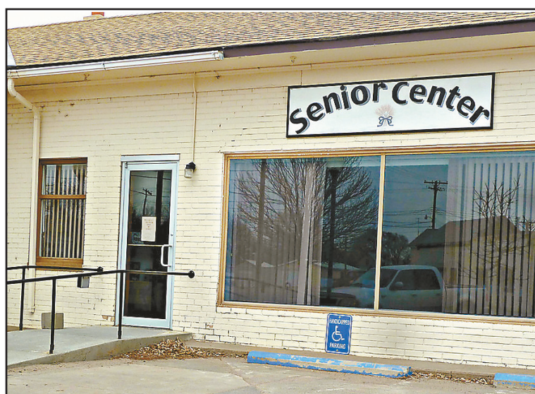
ST. FRANCIS SENIOR CENTER also received a Foundation grant of $6,000 for kitchen remodeling.

Five additional grants were made from the New Generation Fund, an endowment fund within the foundation. These grants included: $700 to the city of St. Francis for art in the park; $700 to the city of St. Francis for trees and shrubs for the Riverwalk; $700 to the Cheyenne County Historical Society for a security door; $600 to the Celebrate St. Francis Committee for 2014 fall festival and homecoming; and $300 to the Cheyenne Center for Creativity,