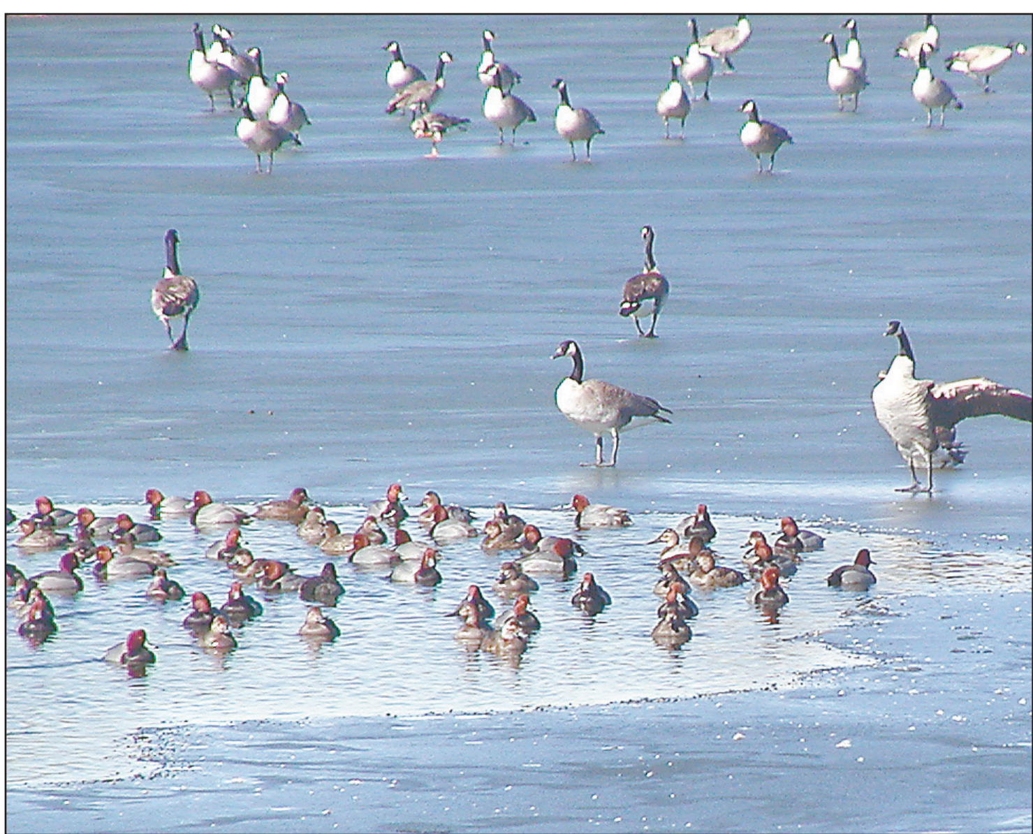
NOT TOO COLD – Despite -0 temps, the ducks and geese were enjoying the ice and water at Keller Pond.

While the official time change is at 2 a.m. Sunday, most people probably will set their clocks up either before going to bed on Saturday or in the morning Sunday. But don't forget, or you'll be having a late start to your day!