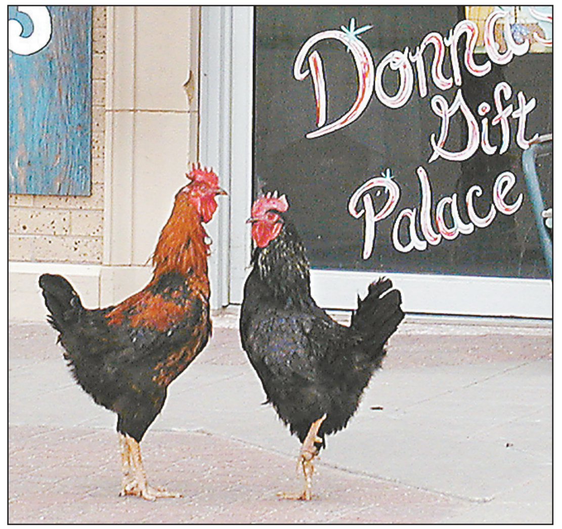
WAITING FOR THE STORE TO OPEN – These chickens and several others were the talk of the town as they casually strolled down Main Street Sunday morning.