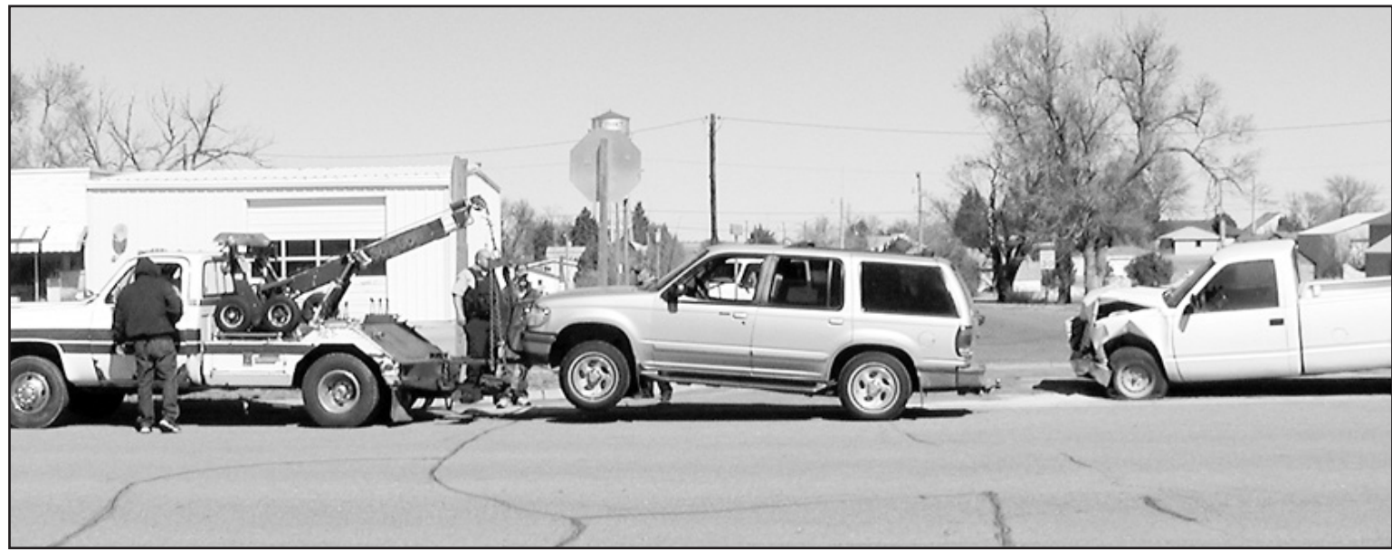
A SECOND MULTI-VEHICLE accident occurred shortly after the accident at Wheeler on March 12. One driver was injured and required medical care.