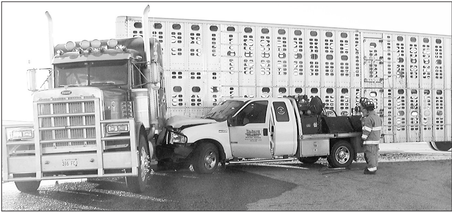
EMERGENCY RESPONDERS were called to a two-vehicle accident on U.S. 36 at Wheeler when a pickup ran into a semi truck that was turning left into the Captain Hook's parking lot. There were no serious injuries.