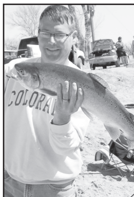
More information, call 785-772-7382

No Charge Saturday, April 5 9 a.m. to noon