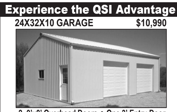
2 -9'x8' Overhead Doors • One 3' Entry Door

*Price does not include windows & gutters