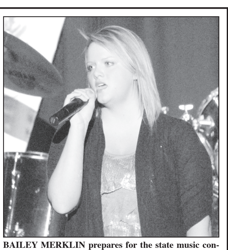
test being held this weekend in Wichita.