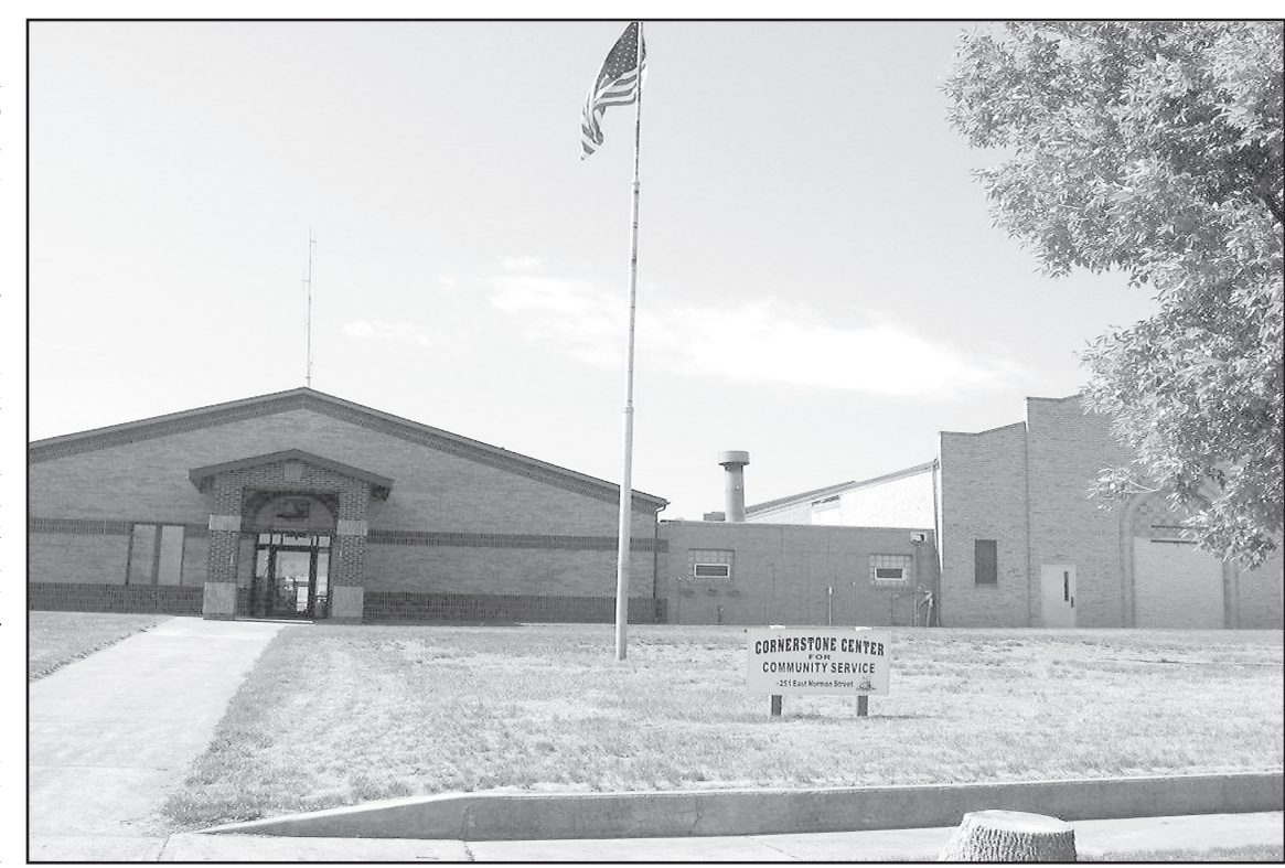
THE CORNERSTONE CENTER for Community Service opened on May 24

The Bulletin Board is reserved for activities that are FREE to the public. Any activities that have a charge will be included Anonymous in the Bulletin Board ONLY if a paid ad is purchased.