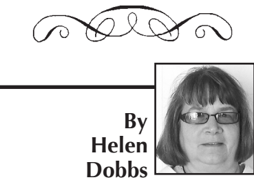
By Helen Dobbs

Travel Industry Association of Kansas is also very happy to see the Legislature's continued support in investing in tourism in Kansas. The Kansas Division of Tourism budget had no changes, and that demonstrates the high rate of return on investment on Kansas tourism dollars. We want to keep Kansas competitive with surrounding states, and tourism funds remain dedicated to direct tourism projects and not diverted to other efforts. Local efforts include distribution of brochures