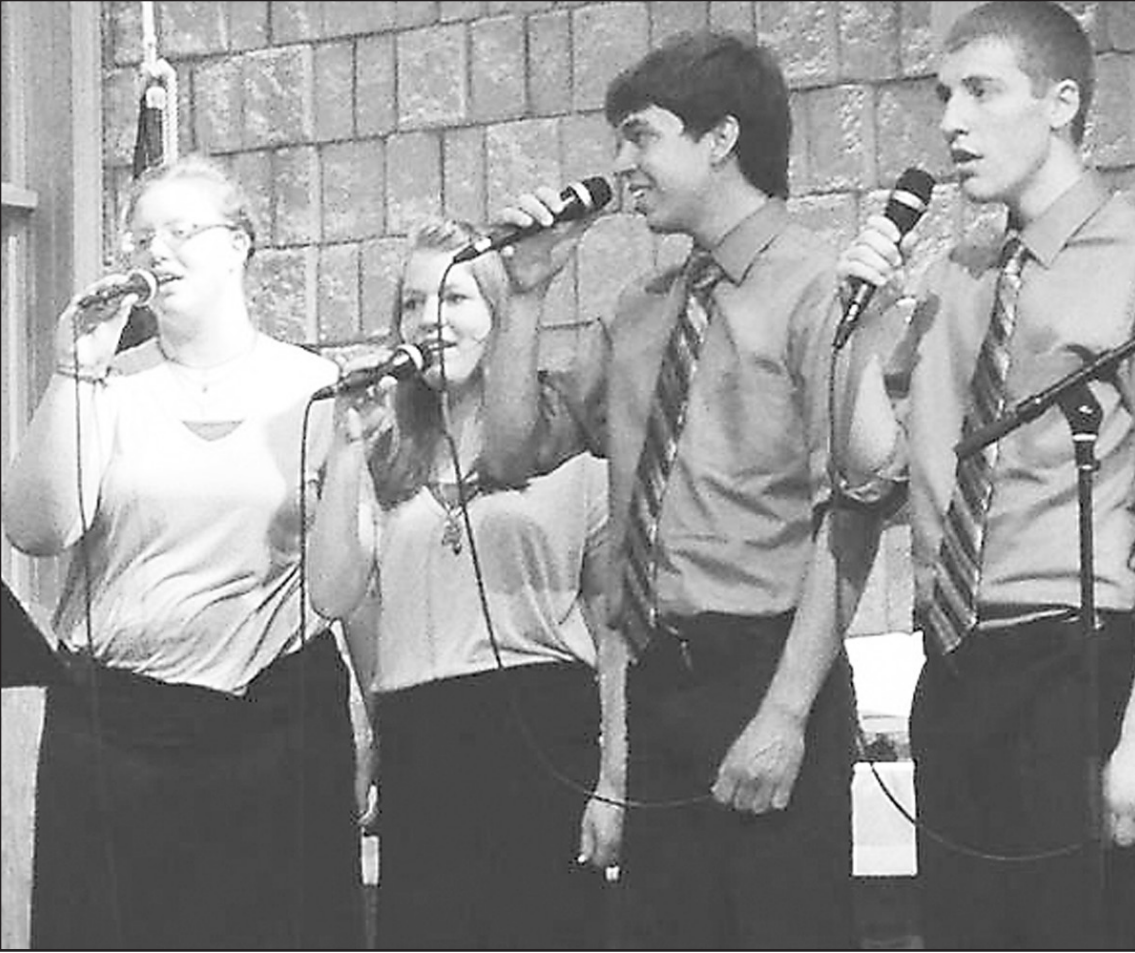
THE AMBASSADORS MUSIC MINISTRY TEAM from Minneapolis, Minn., will be singing at a free concert at Peace Lutheran Church on July 23.