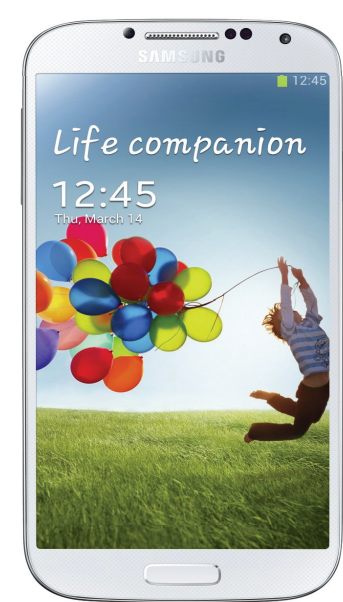
Samsung Galaxy S4