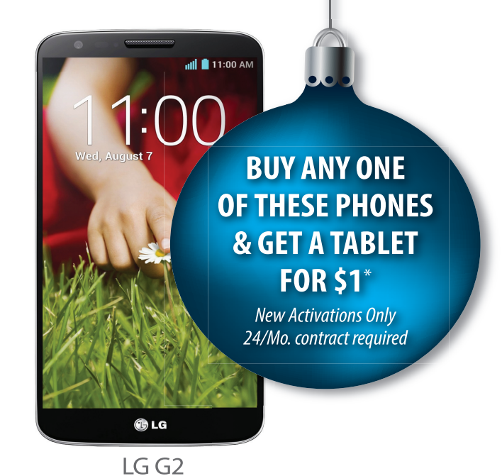
w/24 Mo. CONTRACT New Activations Only