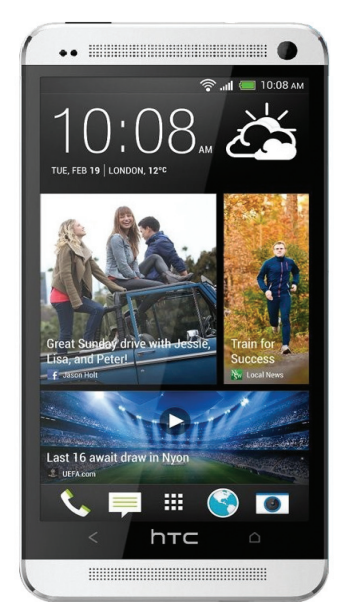
HTC One (M7)