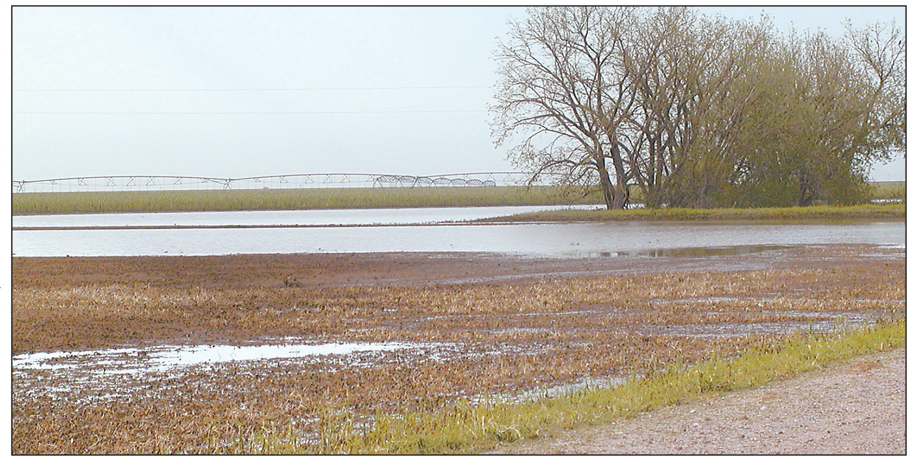
CORN FIELDS WERE STRIPPED and huge ponds were formed as rain and hail fell in a short time on Friday evening.