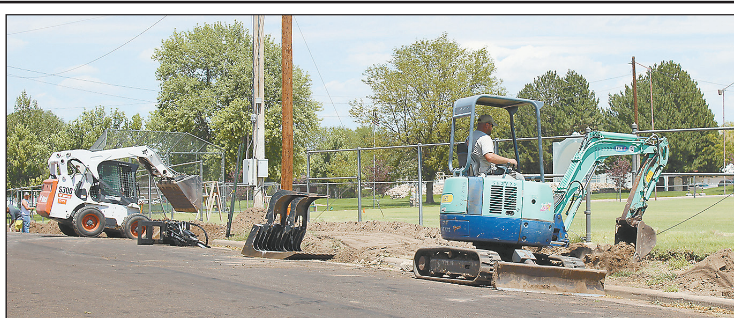
BROCK MCATEE CONSTRUCTION was busy tearing out the sidewalk Monday afternoon to the west of the grade school. A new sidewalk will be in place by the time school starts this year.

Don't forget the Tractor Convoy Breakfast in Wheeler on Friday, Aug. 1, from 8 - 9 a.m.! After breakfast, convoy down to the Thresher Show for fun at the tractor rodeo!!