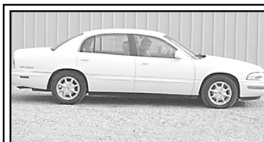
'01 Buick Park Avenue - gray leather interior, several extras including dual climate control, 20,000 miles