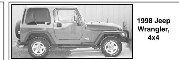
1998 Jeep Wrangler, 4x4