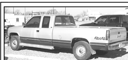
1991 Chevrolet, Ext. Cab