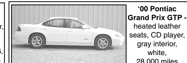
'00 Pontiac Grand Prix GTP - heated leather seats, CD player, gray interior, white, 28,000 miles