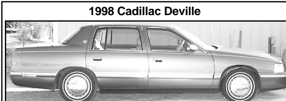
1998 Cadillac Deville