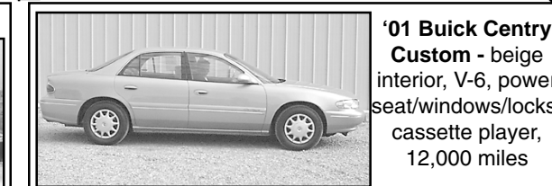
'01 Buick Century Custom - beige interior, V-6, power seat/windows/locks, cassette player, 12,000 miles