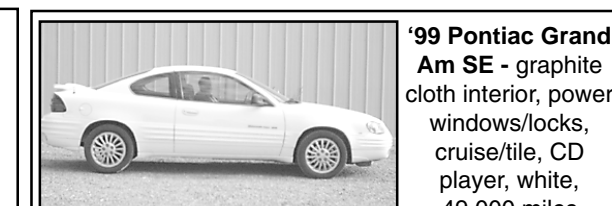
'99 Pontiac Grand Am SE - graphite cloth interior, power windows/locks, cruise/tilt, CD player, white, 49,000 miles