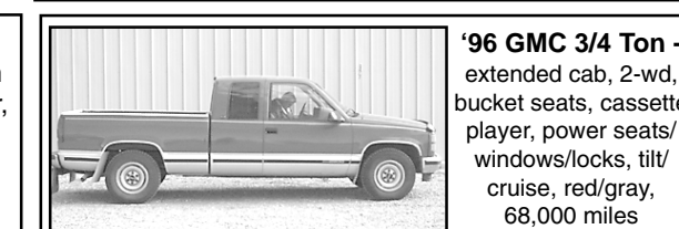
'96 GMC 3/4 Ton - extended cab, 2-wd, bucket seats, cassette player, power seats/windows/locks, tilt/cruise, red/gray, 68,000 miles