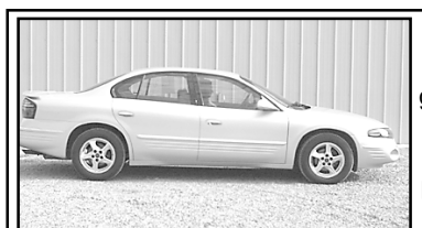
'01 Pontiac Bonneville SE - graphite cloth interior, CD/cassette player, keyless remote & power seats, 3.8 V-6, Silver, 19,000 miles