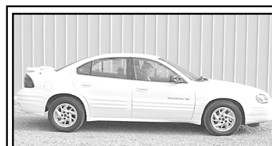
'01 Pontiac Grand Am SE - V-4, CD player, power windows/locks, tilt/cruise, white, 29,000 miles