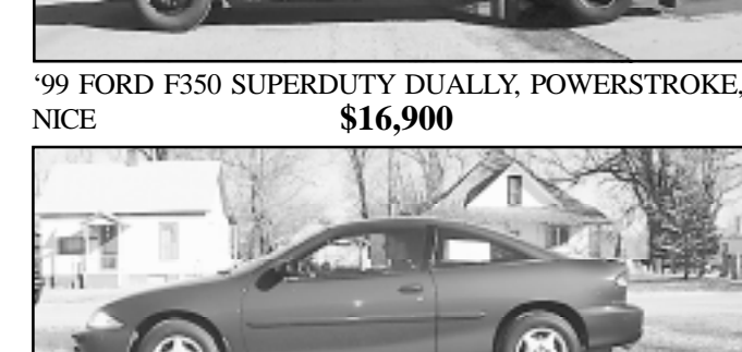
2000 CHEVY CAVALIER, LOW MILES, FACTORY