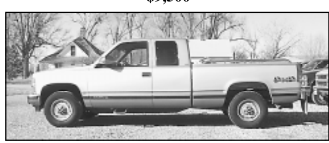
'94 CHEVY 3/4 TON 4X4, 6.5 TURBO DIESEL, A HEALTHY TRUCK $8,500