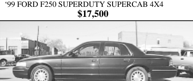
'99 FORD CROWN VICTORIA LX, NICE & CLEAN