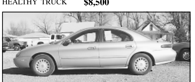
'96 MERCURY SABLE GS, LOADED