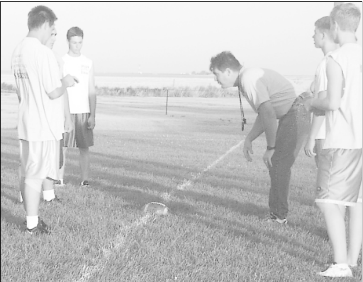
FOOTBALL CAMP is being held this week in Bird City for the Cheylin football players.