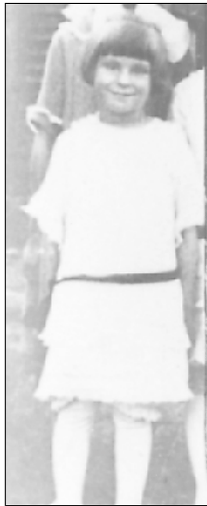
2002 Thresher Queen

She graduated as an A student. She worked for an insurance association and was active in her local church youth organization. She married and they en-