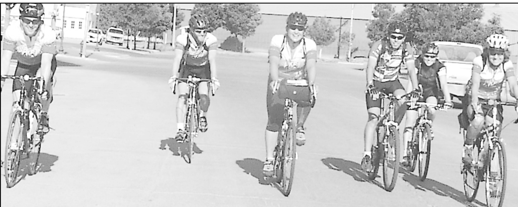
ST. FRANCIS RESIDENTS provided sleeping accommodations for 22 bikers on Monday night. The Bike-Aid riders are traveling across the United States listening to the concerns of the citizens to take with them to Washington, D.C.