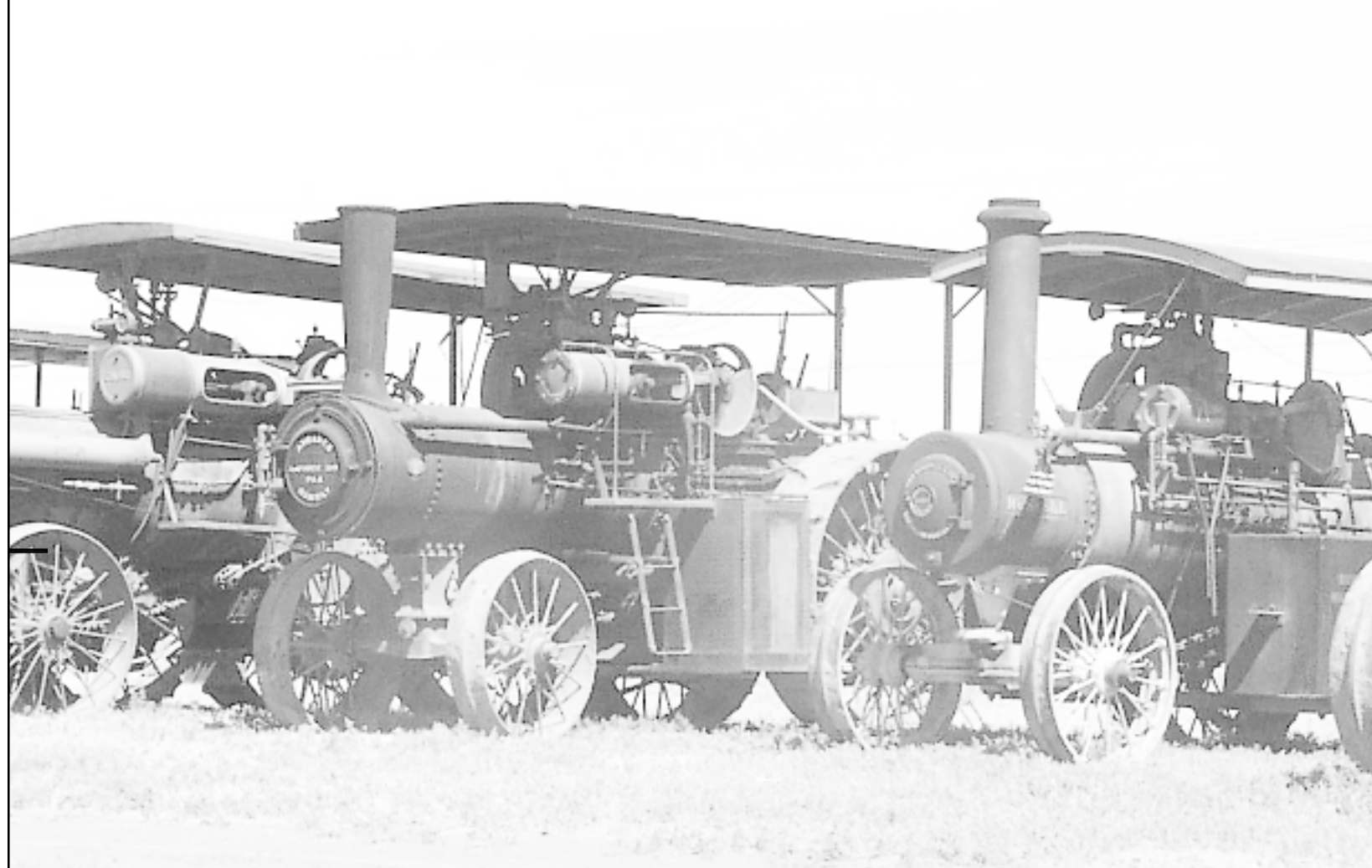
STEAM ENGINES ARE LINED UP and ready for the steam engine races which began at 11:45 each day.