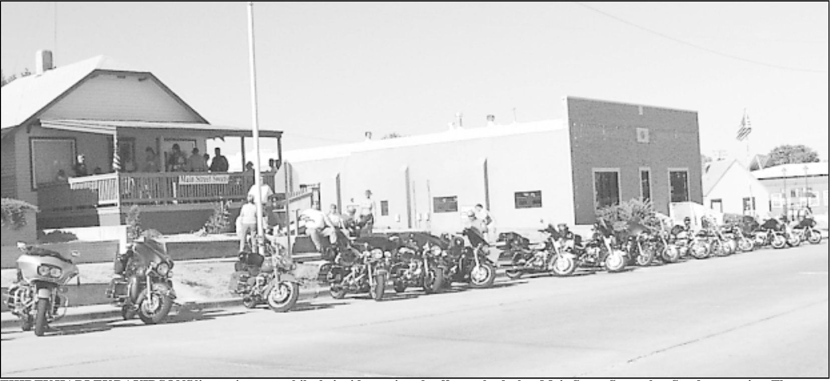
{f THIRTY\, HARLEY\, DAVIDSONS} line main street while their riders enjoyed coffee on the deck at Main {f Street\, Sweets\, last\, Sunday\, morning}. The group was on their way to Estes Park.