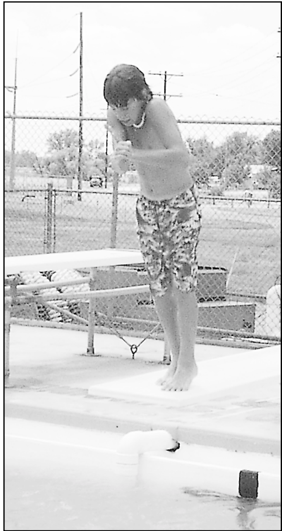
THE LAZY DAYS OF SUMMER have come to a close with the swimming pool closing Sunday. The kids venture back to school Monday with fond memories of the summer.