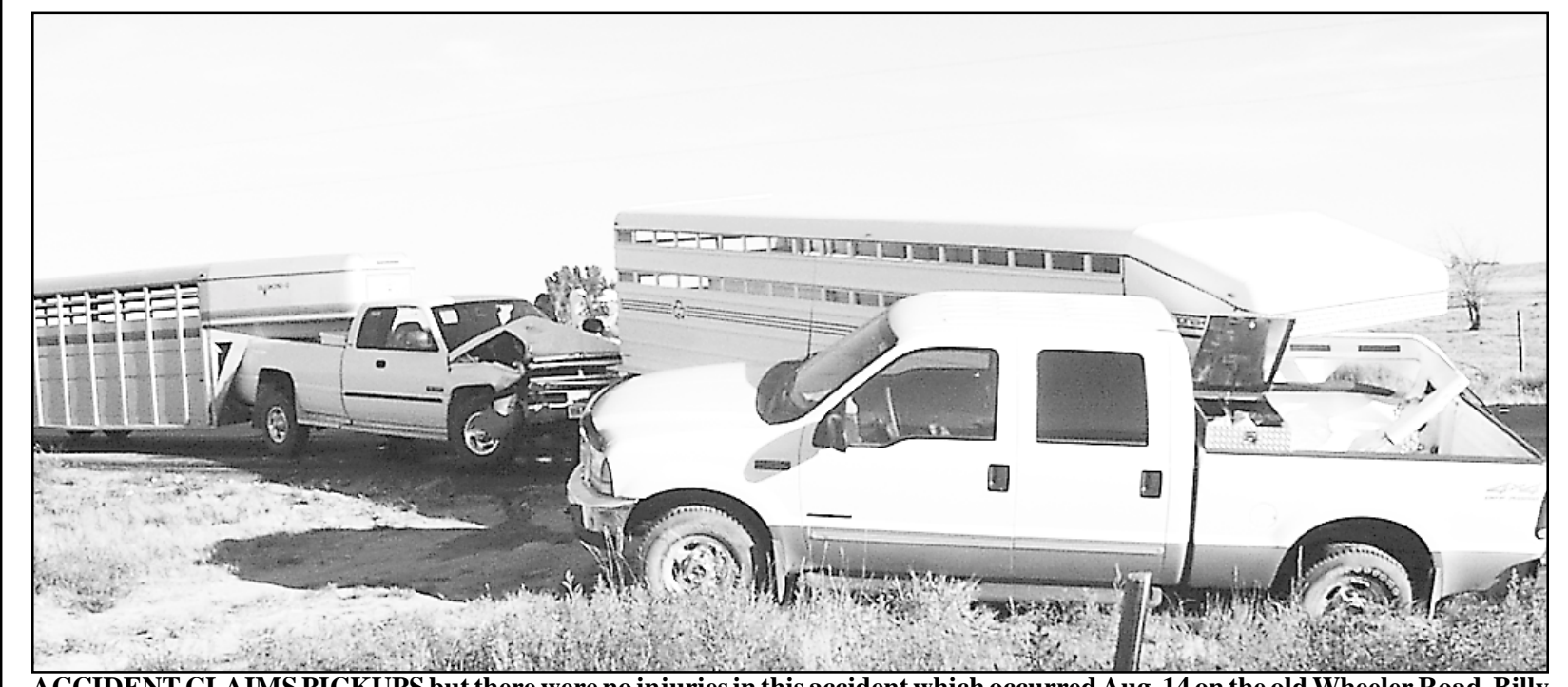
ACCIDENT CLAIMS PICKUPS but there were no injuries in this accident which occurred Aug. 14 on the old Wheeler Road. Billy Lee, driving a 2000 Ford pickup and pulling a livestock trailer, was traveling west when he attempted to pull off the road. Gary Yonkey, driving a 2001 Dodge pickup and pulling a livestock trailer, rearended the livestock trailer pulled by Lee.