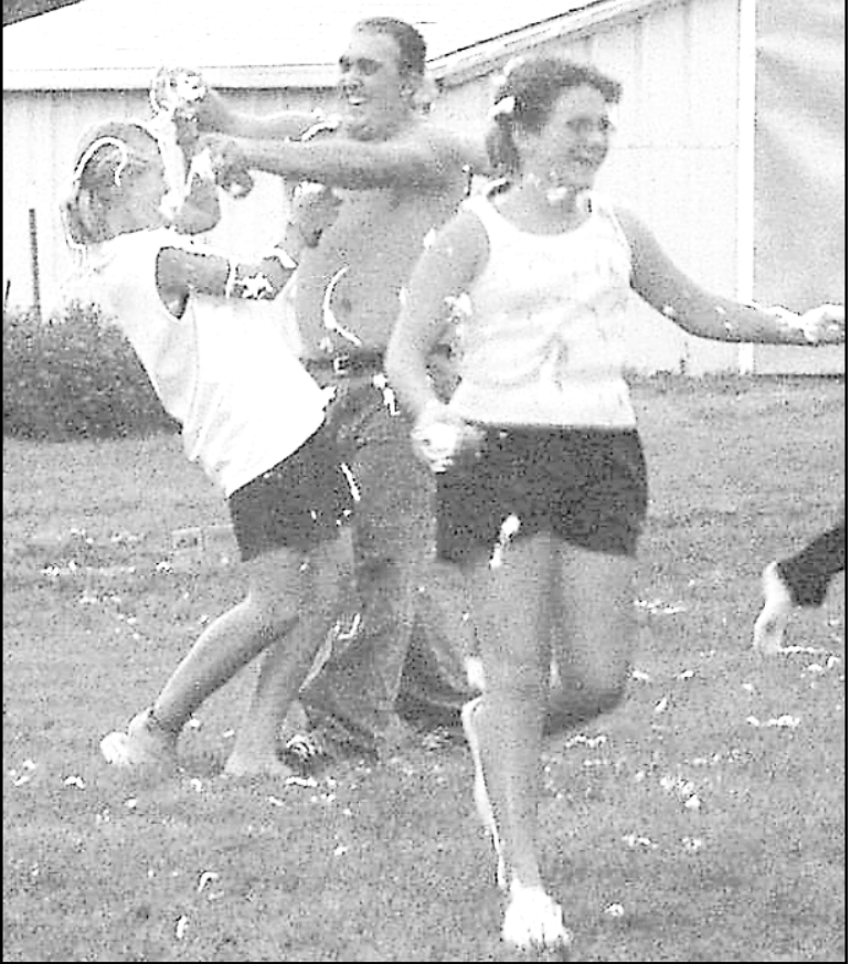
YUK! NO ADULTS wanted to get in the middle of this mess. Last Wednesday at the first meeting for the Bird City Teens for Christ, the youth participated in a banana split contest which then proceeded into a shaving cream war.