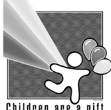
Children are a gift