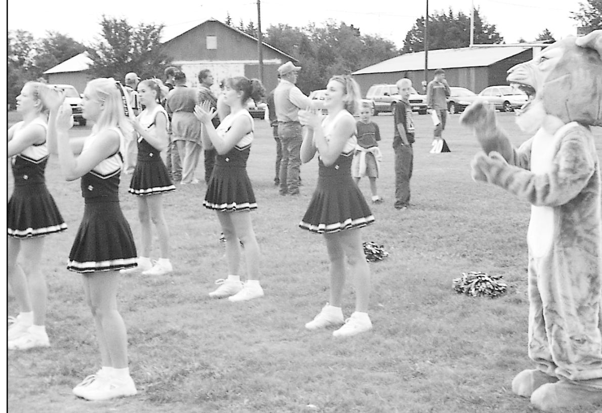
CHEYLIN CHEERLEADERS and the Cougar Mascot cheer the crowd on while during half time the future cheerleaders of Cheylin show what they can do.