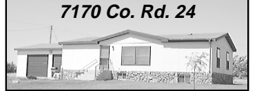
7170 Co. Rd. 24

TRACT 1 - Country Home & Improvements on 20± ac. 3 mi. North, 4 mi. East & 3/4 mi. North of Goodland Located in NE corner of NE/4 Sec. 14, 7-39, Sherman Co.