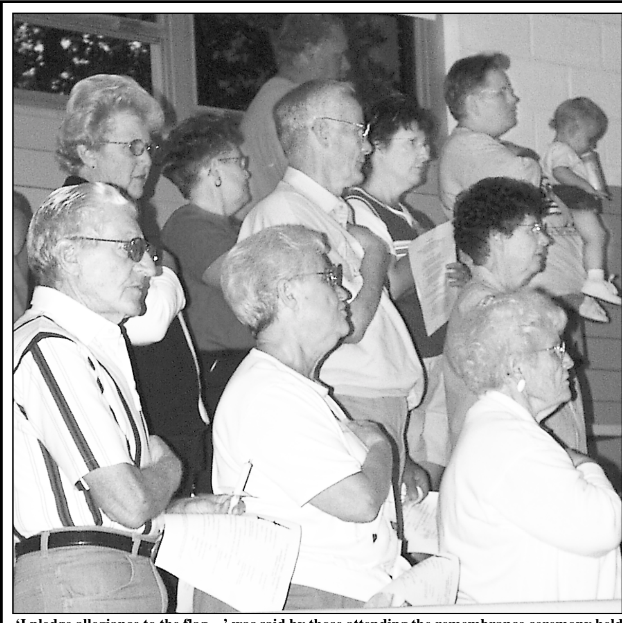
'I pledge allegiance to the flag....' was said by those attending the remembrance ceremony held Sept. 11 at the St. Francis Grade School.