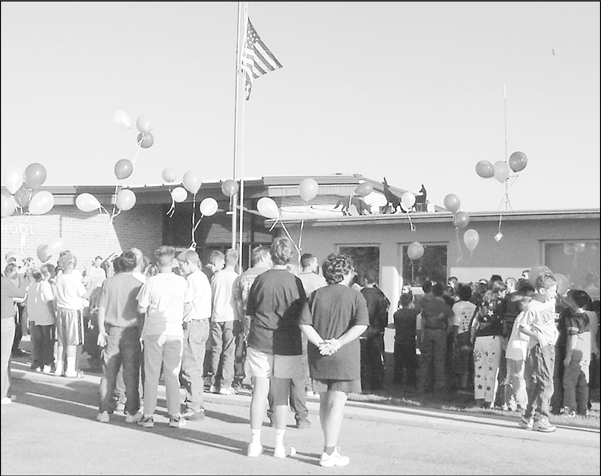
CHILDREN, TEACHERS, and parents join to remember September 11, one year ago.

After this information has been obtained and flags/banners ordered, a public function will be held for presentations.