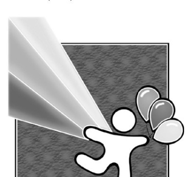
Children are a gift

The Cheyenne County Helping Hands Coalition can help. Call the SRS office at (785) 332-2021.