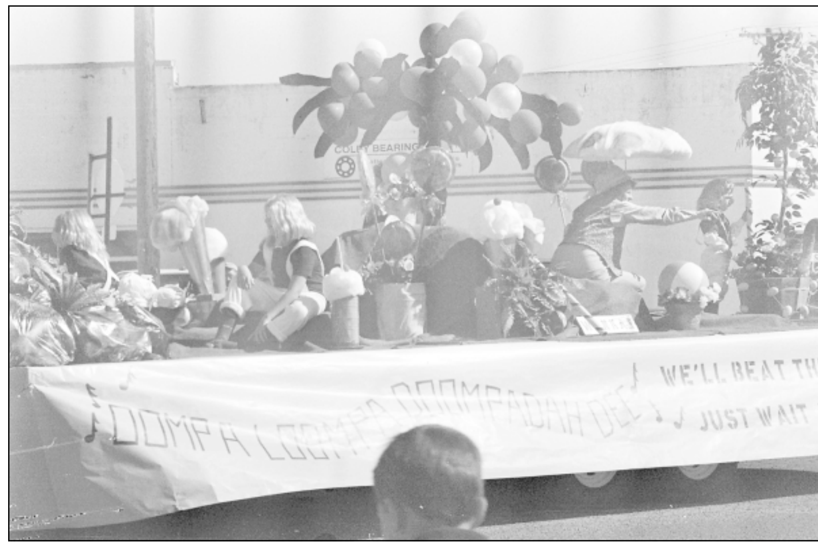
FLOATS WERE A big part of the Cheylin Homecoming Parade as they traveled down Bird Avenue Thursday among a large turnout of supporters.