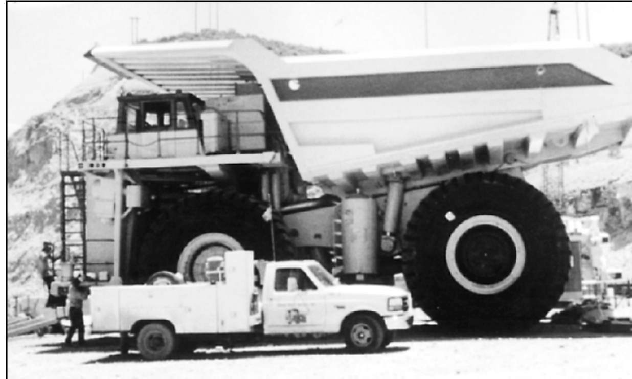
THE BED OF THE TRUCK which was at the Windmill Restaurant in September has now been installed on the truck. Notice the size of the men and truck beside the wheels of the dump truck.