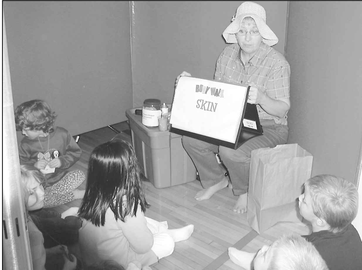
STUDENTS LEARN about the body during the "Body Walk" presented at the grade school.

Body Walk, developed by Nutrition Services, Kansas State Department of Education, featured a nine-stop tour of the body from the brain to the mouth, stomach, small intestine, heart, lungs, bones, muscles and skin.