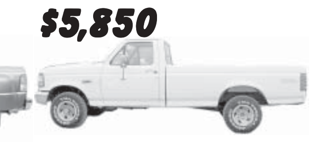
'95 FORD F150 4X4 Good Straight 4x4