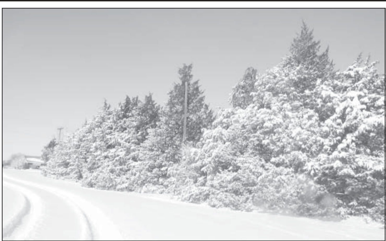
BEAUTIFUL SNOW - Moisture is needed in Cheyenne County and the Saturday night's snow was welcomed by area residents.

Many of those participating on March 8 will be traveling to Regional 4-H Day from 5 to 9 p.m. on March 28 at the Brewster High School.