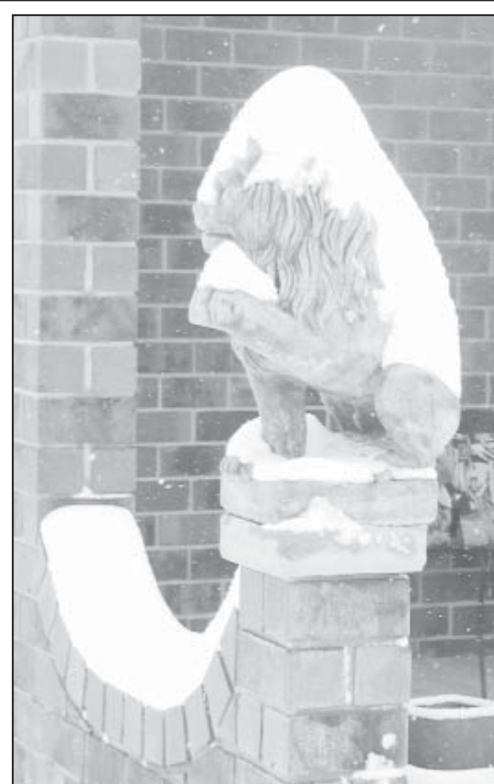
COVERED WITH SNOW — This lion is snowed under after a recent snow storm. The temperatures made change on Tuesday when they dropped from a warm 60 degrees.

The Cheyenne County Helping Hands Coalition can help. Call the SRS office at (785) 332-2021.