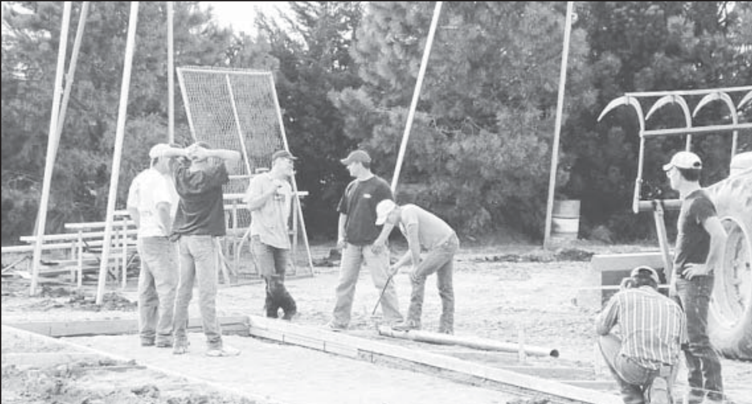
HOMESTEAD MEMORIAL Park comes to life with the help of volunteers willing for a better sports facility. Soon local youth will be hitting for the fences and enjoying the new features the baseball field will have.

Local Option Budget funds have been used for utilities (heating and electricity), insurance, food service and transportation.