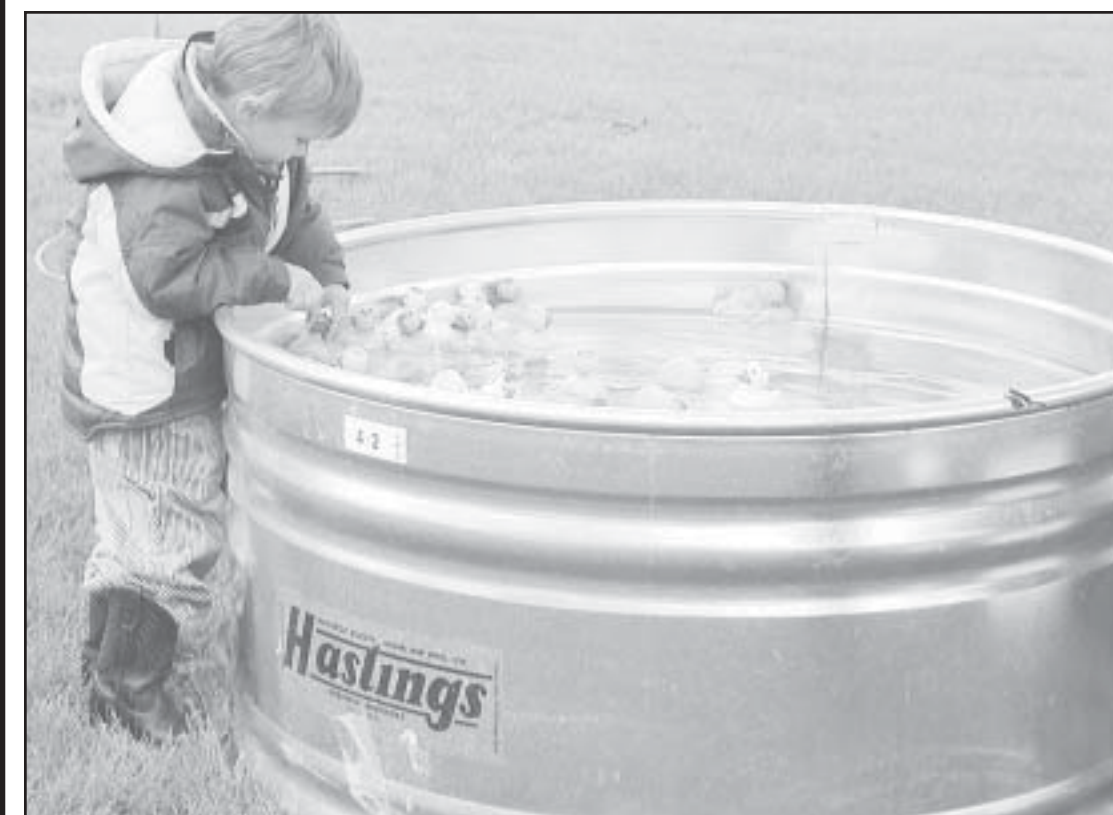
COMING FROM COLBY, this boy enjoyed playing with the ducks that would later be sent down the Republican River with the fastest duck bringing home winnings to the owner.