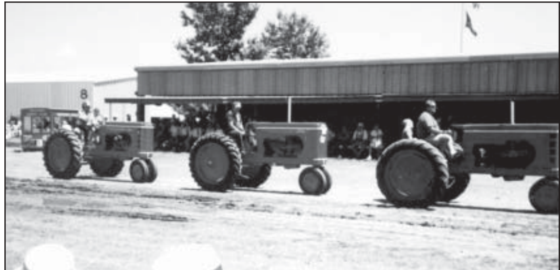
ANTIQUA TRACTORS parade at the thresher show.