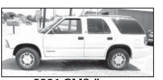
2001 GMC Jimmy

Diesel, manual transmission, 4-wheel drive, bench seat, power locks/windows, tilt/cruise, 95,000 miles, Great Work Truck!