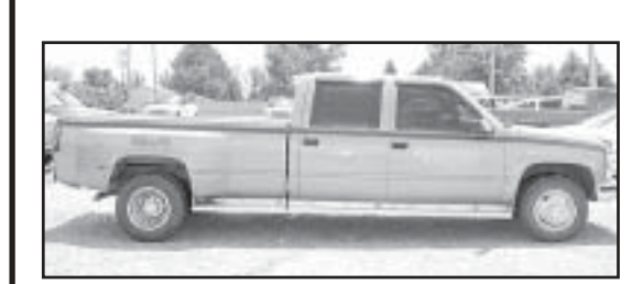
1995 Chevrolet Dually

Silver, automatic, 4-door, cassette, 22,000 miles.